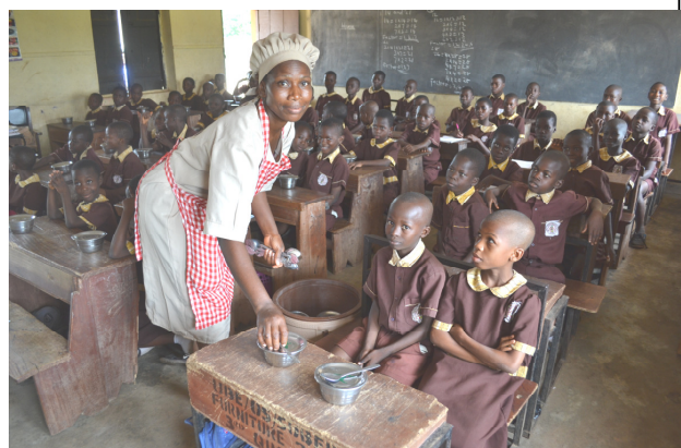
Food vendor serving the children their school meal

"My joy will know no bounds if HGSF is extended to all the pupils in all the Nigerian schools"