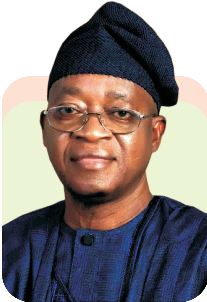
HIS EXCELLENCY ADEGBOYEGA OYETOLA THE EXECUTIVE GOVERNOR, STATE GOVERNMENT OF OSUN