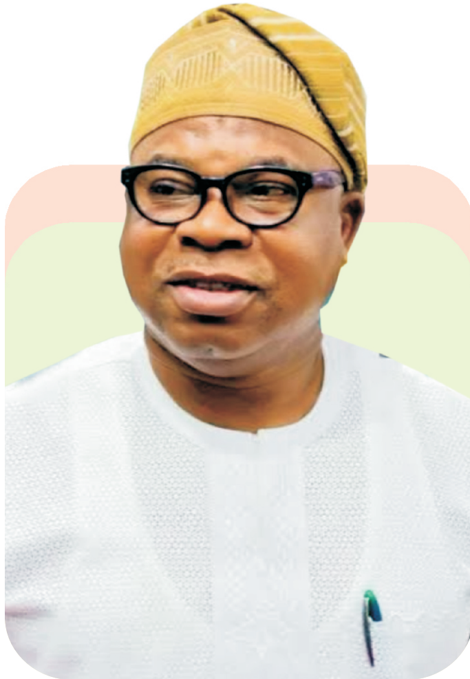
HON. BOLA OYEBAMIJI COMMISSIONER FOR FINANCE, STATE GOVERNMENT OF OSUN