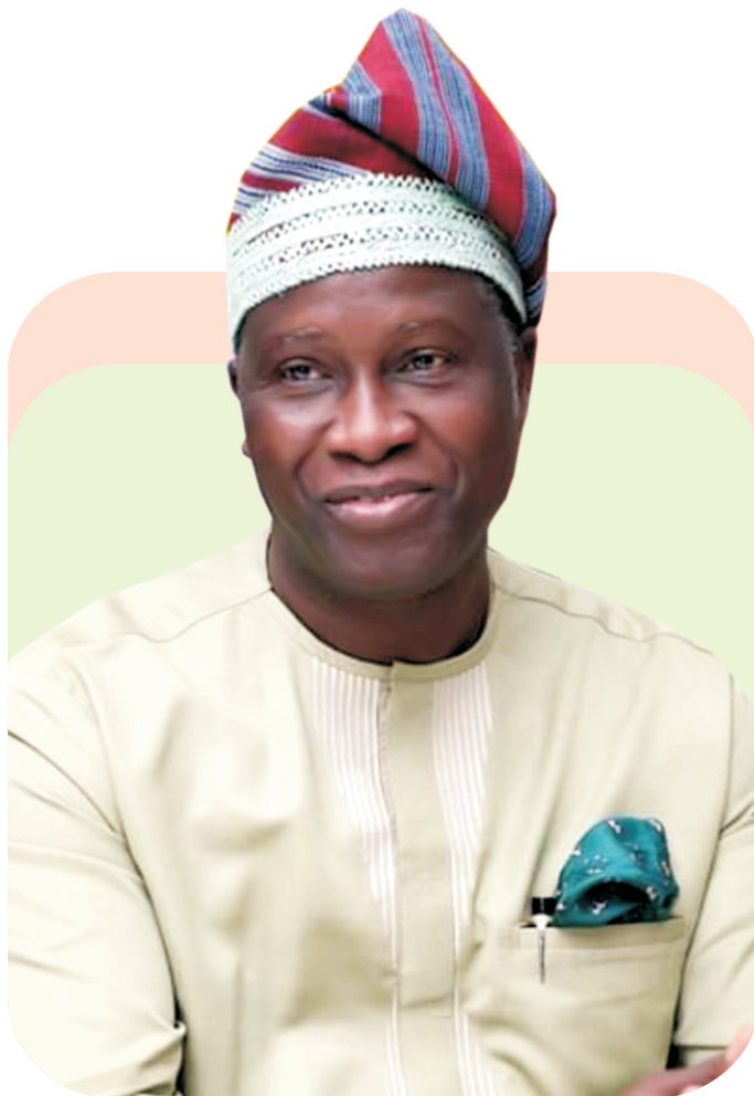
HIS EXCELLENCY BENEDICT OLUGBOYEGA ALABI THE DEPUTY GOVERNOR, STATE GOVERNMENT OF OSUN